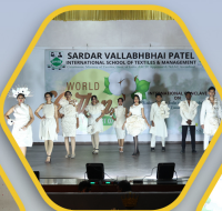
World Cotton Day