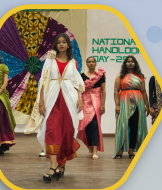
National Handloom Day