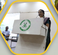
World Water Day